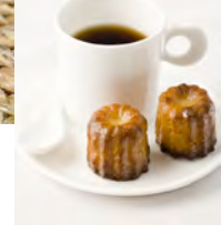
Les canelés de Céline